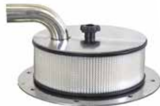
Filter kit to be mounted on container supplied by others.